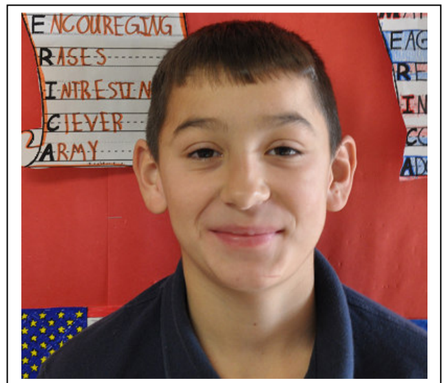
A proud day at Sacred Heart Catholic School!!